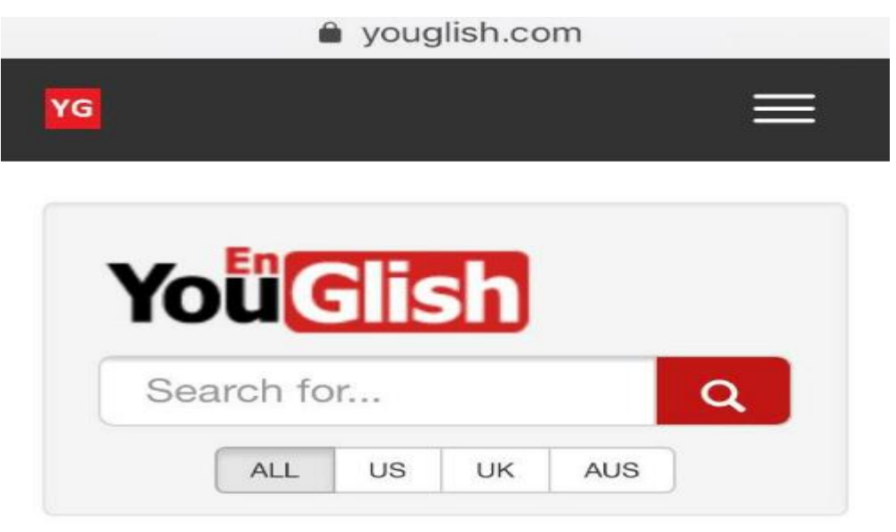
We all glish for English!

YouGlish is the helpful website for checking pronunciation. YouGlish uses YouTube to improve your English pronunciation. With more than 50M tracks, YouGlish gives you fast, unbiased answers about how English is spoken by real people and in context. I think that being able to watch a video so you can listen to the pronunciation of a word in context make Youglish a unique tool.