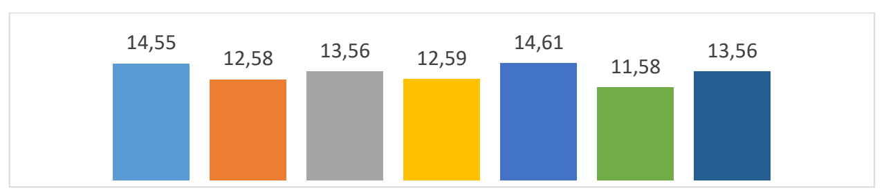
The dynamic state of the athletes of the control (NG, n=15) group performing special exercises at the beginning of the pedagogical experiment

In order to determine the level of general physical fitness of young people engaged in Greco-Roman wrestling in Navoi city sports school of Navoi region, they were taken on a high horizontal bar, climbing a rope and other special exercises. According to him, the control group Greco-Roman wrestlers at the beginning of the study showed a mean value of 11.48 high bars (times), a mean square deviation of 1.67, a rope climb (times) showed the mean value of 2.17, the root mean square deviation of 0.27, the mean value of bending and spreading the arms while lying on the arms (times) was 33.12, the root mean square deviation work showed 4.49, sitting with an opponent equal to his own weight on the shoulders (times) showed a mean of 11.76, a mean square deviation of 1.48, lying arms behind the head (press) showed a mean value of 29.36, mean square deviation of 4.29, standing jump up 10 (times) mean value of 7 showed .34, the mean square deviation was 0.85, Kneeling 10 m walk showed the mean value 6.93, the mean square deviation was 0.94.